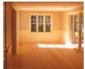
Gleaming Southern pine floors throughout the open and bright first floor are awash in sunlight from plenty of windows and sliding glass doors.