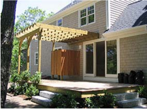
Entertainment sized deck and outdoor shower.