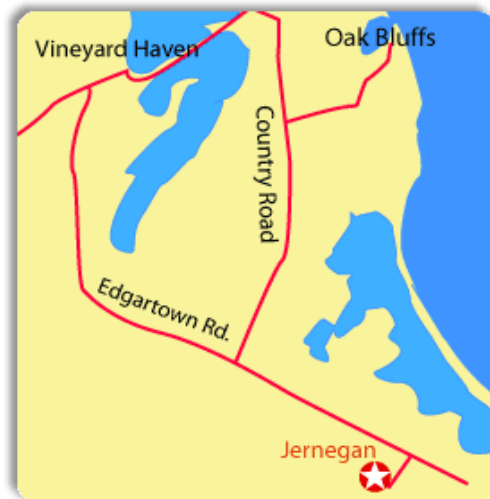
Just minutes to downtown Edgartown and a short ride to State Beach are just some of the amenities offered by this new Captain's Colonial from R..H. Burpee Company.