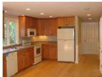
Spacious and bright kitchen is equipped with under cabinet and recessed lighting, plenty of storage

THE SECOND FLOOR has two generous bedrooms, full bath and large open loft/tv area. Baths offer tile floors, painted pine floors with matchstick wainscoting in many rooms complete that Vineyard look.