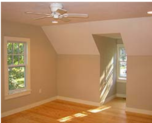
Dormered window and ceiling fan in the second floor bedroom.