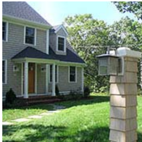
"Burpee Built" homes have generous landscaping and lighting allowances